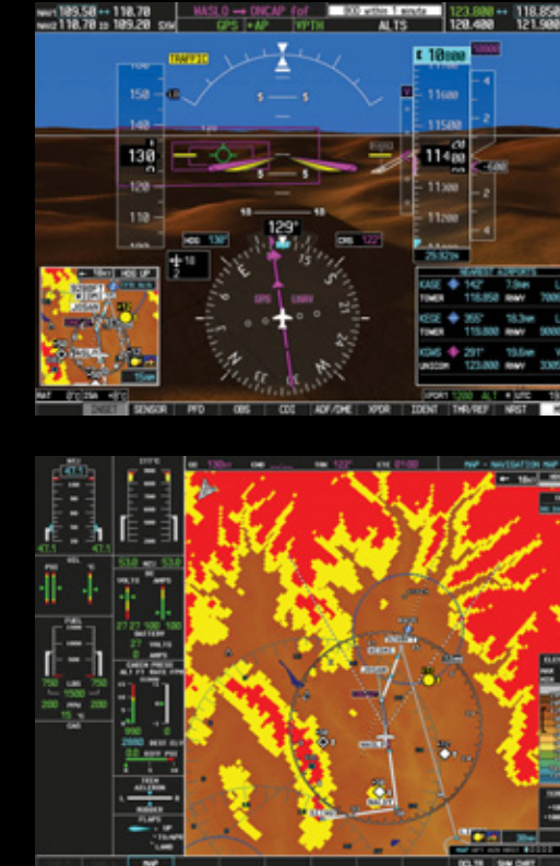
Optional Synthetic Vision Technology creates a 3D topographic landscape from the G1000's database. The resulting display depicts ground and water features, airports, obstacles and traffic all in relative proximity to your Mustang.

The Mustang flight deck has been thoughtfully designed to provide advanced instrumentation and flight controls in an easy-to-manage cockpit environment. Central to the experience is the Garmin G1000 avionics suite, which features two Primary Flight Displays (PFDs) flanking the largest Multi-Function Display (MFD) in the industry. Using the highly regarded and intuitive interface, pilots can easily call up and display NACO approach plates and taxiway maps using Garmin FliteCharts™ and SafeTaxi™ (in the U.S.) on the MFD. The bright, easy-to-read screen also displays flight control, weather, and other important information, all at a glance. And new TCAS II technology warns of threat proximity using both visual display and voice alerts for increased situational awareness.