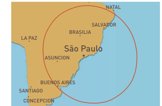
Depicted range is approximate. Map distortions prevent exact range representation. Assumptions: NBAA IFR Reserves (100 nm), ISA Enroute, 85% Boeing Winds, Great Circle Distances, High-Speed Cruise, one pilot, two passengers.