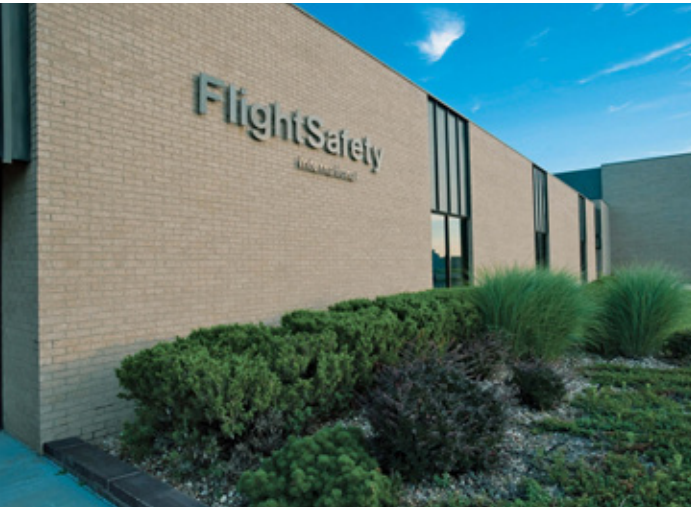
FlightSafety Learning Centers are located at major business aviation airports and feature state-of-the-art training equipment and course materials that have been developed in close cooperation with Cessna.

BACKED BY AN INDUSTRY-LEADING WARRANTY. Your Citation Mustang comes with one of the most comprehensive airframe warranties available. The airframe, engines, and Cessna-made components are covered for three years or 1,000 operating hours. Garmin avionics are covered for two years, and all other components are warranted for one year. And you will never deal with multiple vendors for an issue. All warranty work is administered by Cessna, and no manufacturer has more experience in keeping your aircraft in peak performance. In addition, your purchase price includes enrollment for one year in CESCO, our electronics maintenance records service that helps ensure your Mustang is compliant with all maintenance requirements.