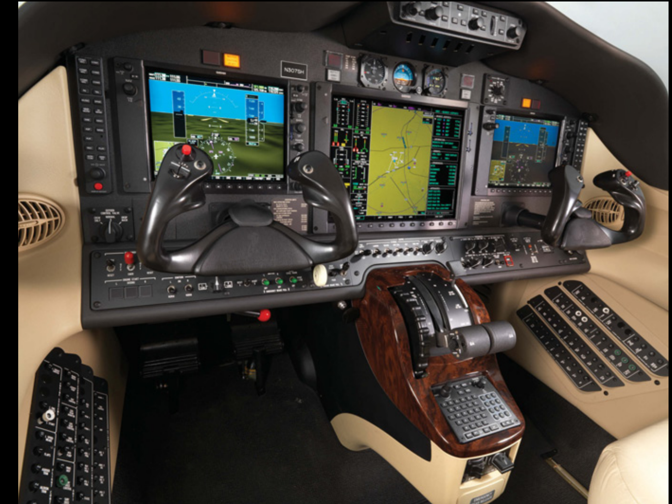
Simulated flight information.