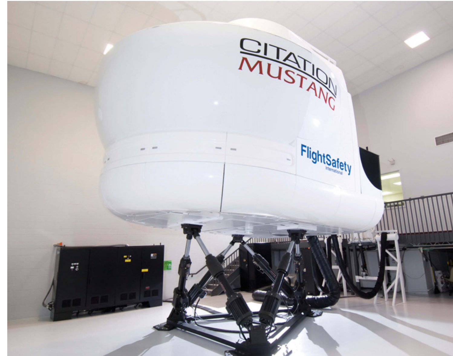
FlightSafety's fleet of full-flight simulators provides a highly realistic training environment that allows pilots to practice scenarios that would otherwise be either impractical or impossible in an actual aircraft.

When moving from propeller aircraft to jets, or from a different jet type, training is critical, not only to safe operation, but to the enjoyment of flying. Cessna has long partnered with the world's foremost aviation training provider, FlightSafety International, to provide the highest quality pilot and maintenance technician training to new Mustang operators. At FlightSafety Learning Centers in Wichita, Orlando, and Farnborough, Mustang owners or their crews can receive full-motion simulator training from experienced Citation instructors while preparing to take delivery of their new aircraft. Training for Mustang maintenance technicians is offered at the Cessna maintenance training facility in Wichita.