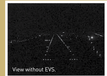
View without EVS.