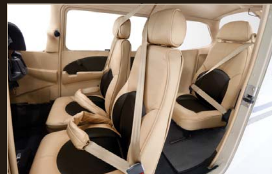
Optional three-seat training configuration