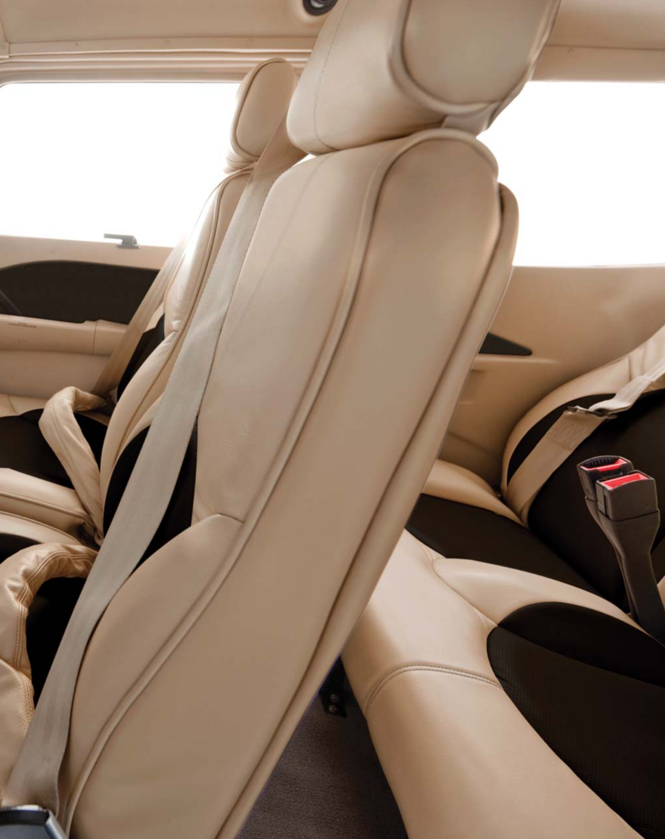
Spacious, leather-appointed rear seats