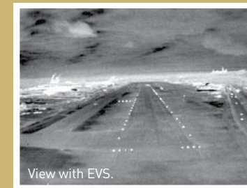
View with EVS.

The EVS feed may be displayed in large format on the G1000's MDF for easy reference on approach and then reduced in size and shown alongside the airport map to aid in ground maneuvers. EVS greatly enhances situational awareness in flight and on the ground with virtually no weight penalty, increasing the utility of your Skyhawk SP and enhancing peace of mind for pilot and passengers alike.